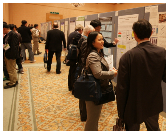
Fig. 5. Snap shot of poster presentation.

The number of poster presentations showed the significant progress of PSA. One hundred sixteen posters were presented in convention hall C. It was a great idea to print the ballot paper and the drink tickets on the same paper so the participants would not miss the opportunity to vote in the poster presentation area. During the poster presentation, beer and other beverages were served at a beverage bar and a box to collect the ballot papers was available to select the best poster presentation for the Powell prize award.