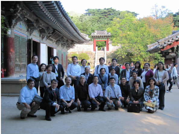
Fig. 13. Photo at Bulguksa (Japanese guide).