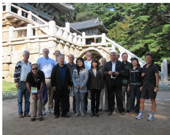
Fig. 12. Photo at Bulguksa (English guide).