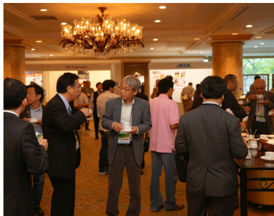
Fig. 8. Exhibition booth during tea breaks.