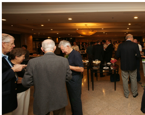
Fig. 9. Welcome reception on Oct. 3.