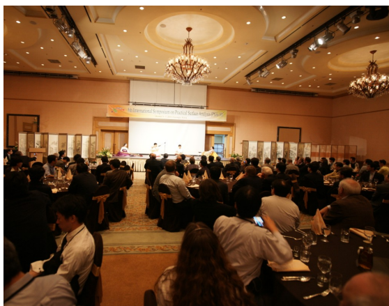
Fig. 10. Photo at the symposium banquet.